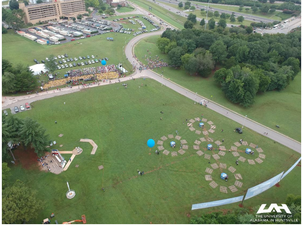
Figure 2. An Aerial Image of the Rocket Launch Setup